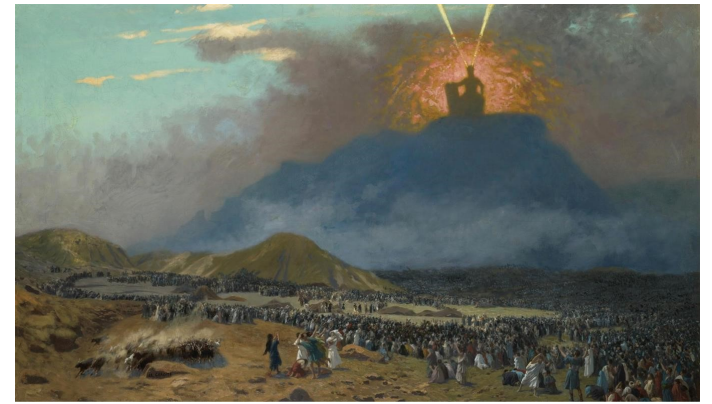
Moses on Mount Sinai, Jean-Leon Gerome (1895-1900)