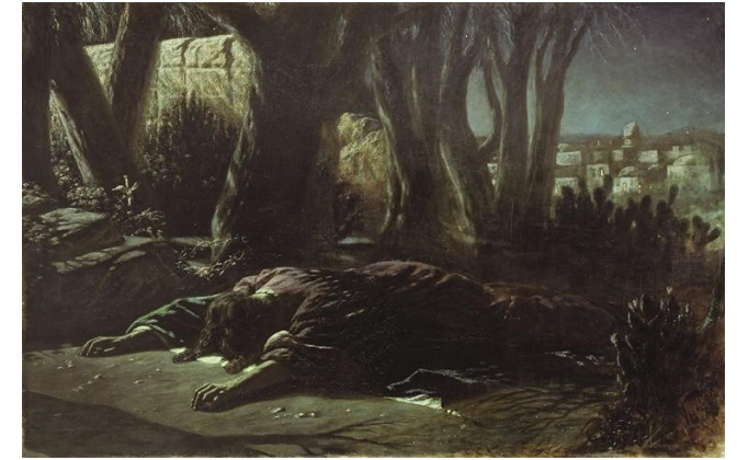
Christ in Gethsemane, Vasily Perov (1878)