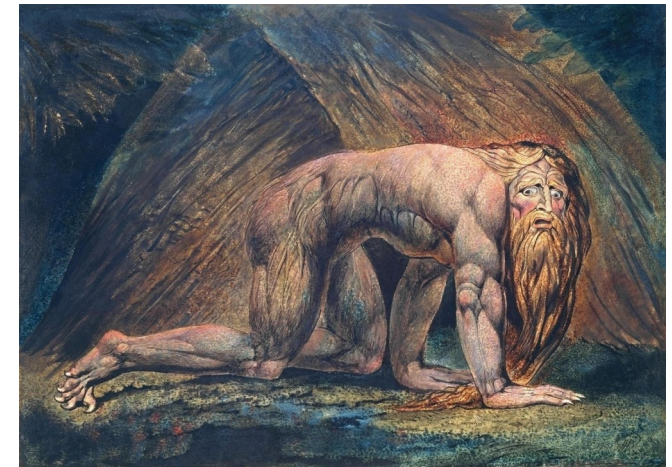
Nebuchadnezzar, William Blake, Tate Collection Accession Number: N05059