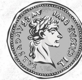
“Tiberius Caesar, Son of the Divine Augustus”