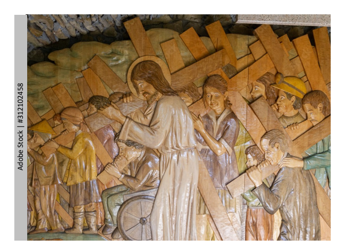
September 25, 2022